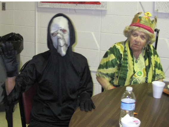
WEDNESDAY NITE HALLOWEEN PARTY