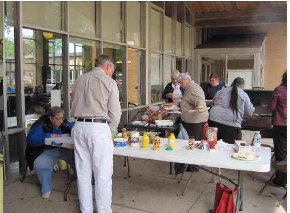
HAPPY NOW THE CLOWN AT SUMMERS END PARTY