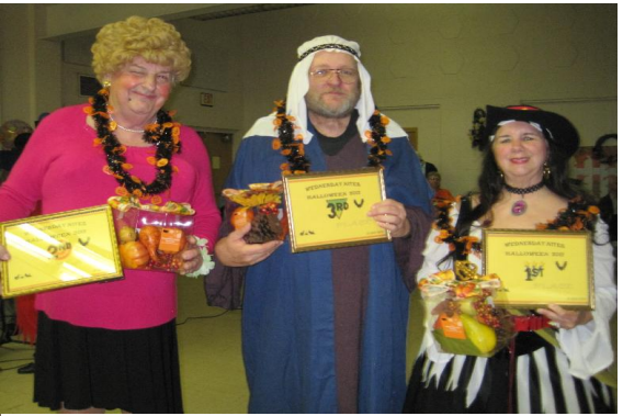
Y'ALL COME AND JOIN US NOW