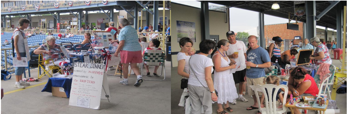
Y'ALL COME AND JOIN US NOW