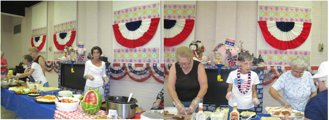
JULY 4 th DAY OF SHARING PARTY